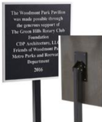
Post Mount (Type F) up to 720 sq. in.