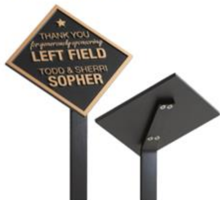
Garden Stake Mount (Type E) Single stake up to 12" x 8" Double stake up to 20" x 8"