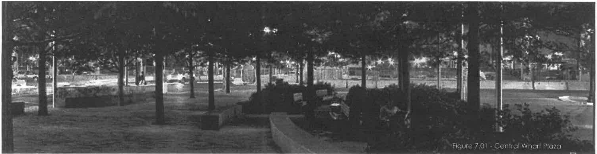
Figure 7.01 - Central Wharf Plaza