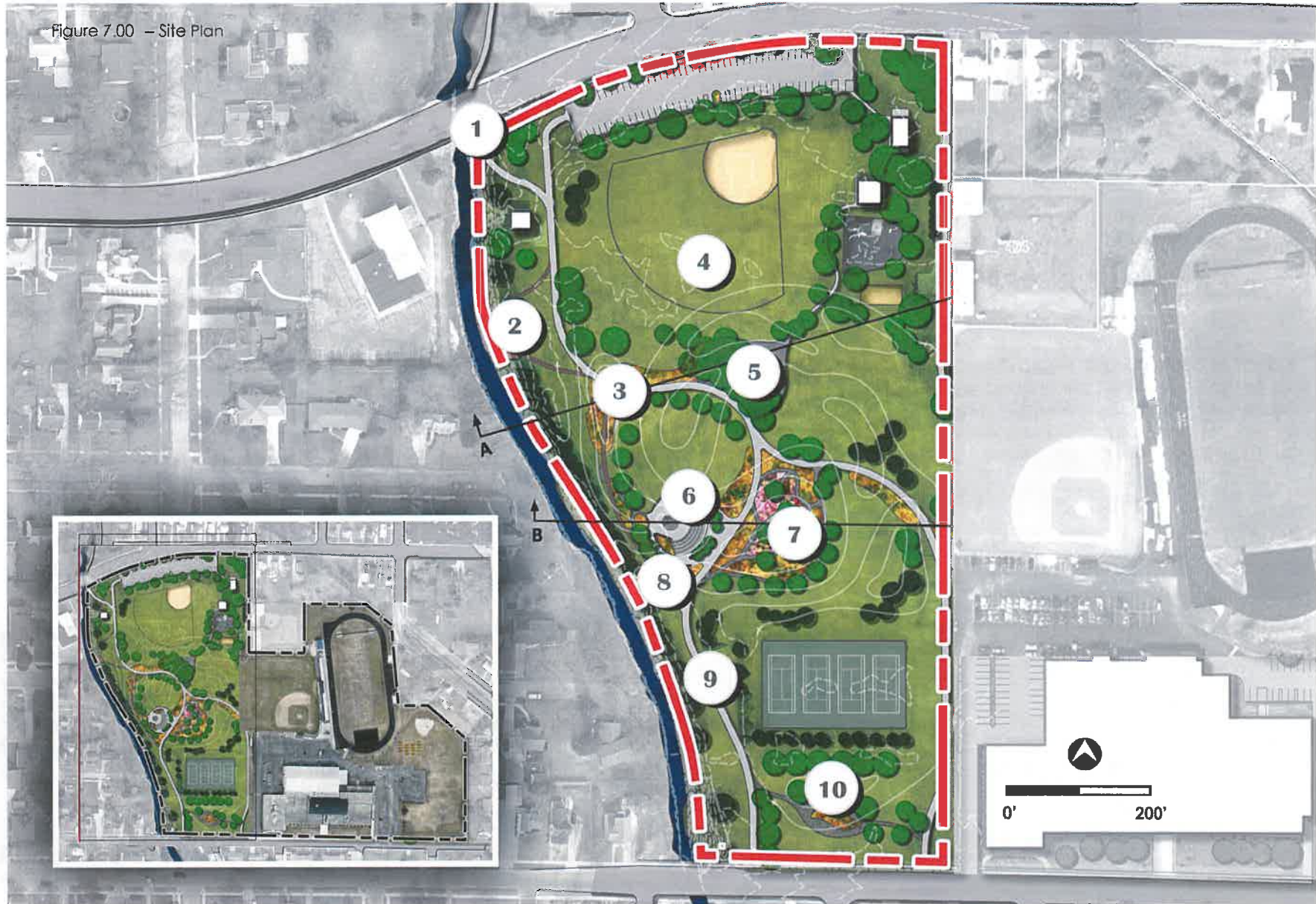
Figure 7.00 – Site Plan