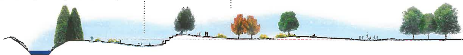
SECTION B-B' SCALE: 1/4" = 10'-0" *Red dotted line represents existing elevation

Similar to the educational nodes, these smaller spaces allow users to relax while on breaks or a quick walk in the park.