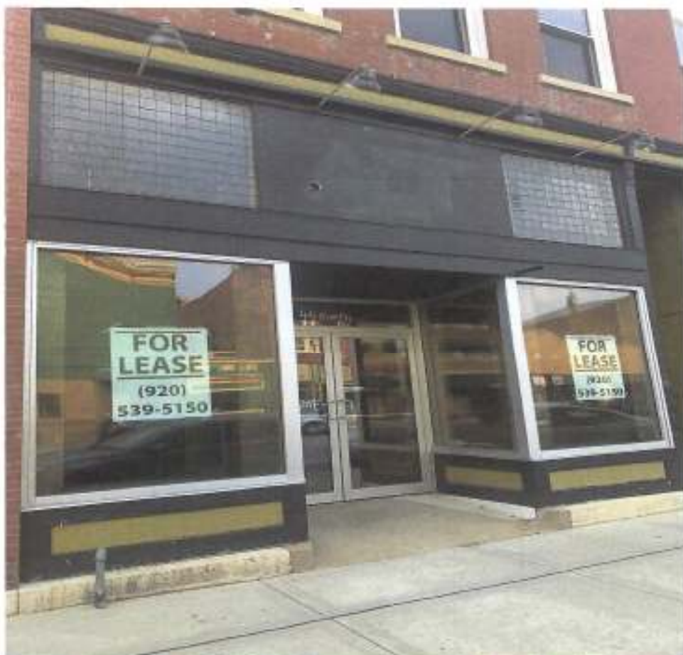
Current Look of 44 N. Main St.